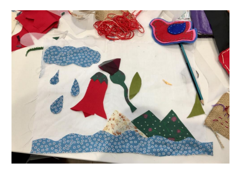
Photo gallery of the outcomes from the arpillera workshop that accompanied the Stitching Memory exhibition, marking 50 years of solidarity in Scotland. The arpilleras on display and the textiles I showed in my presentation all had a strong connection to human rights, exile, and refugees. The question I led with was about what solidarity means to the participants.